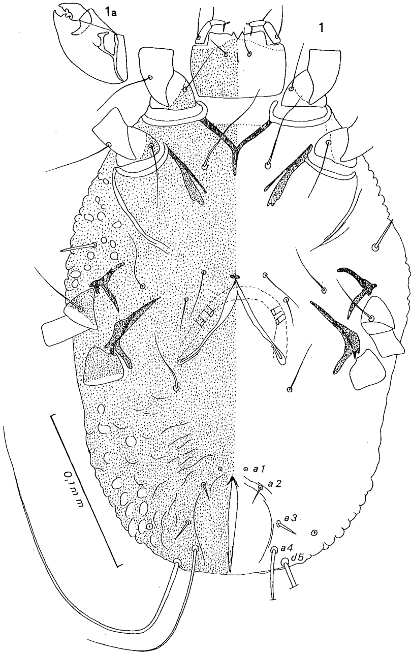
Fig. 1. — Gypsodectes verrucosus n. sp. - Female, in ventral view (1); Chelicera (1a)