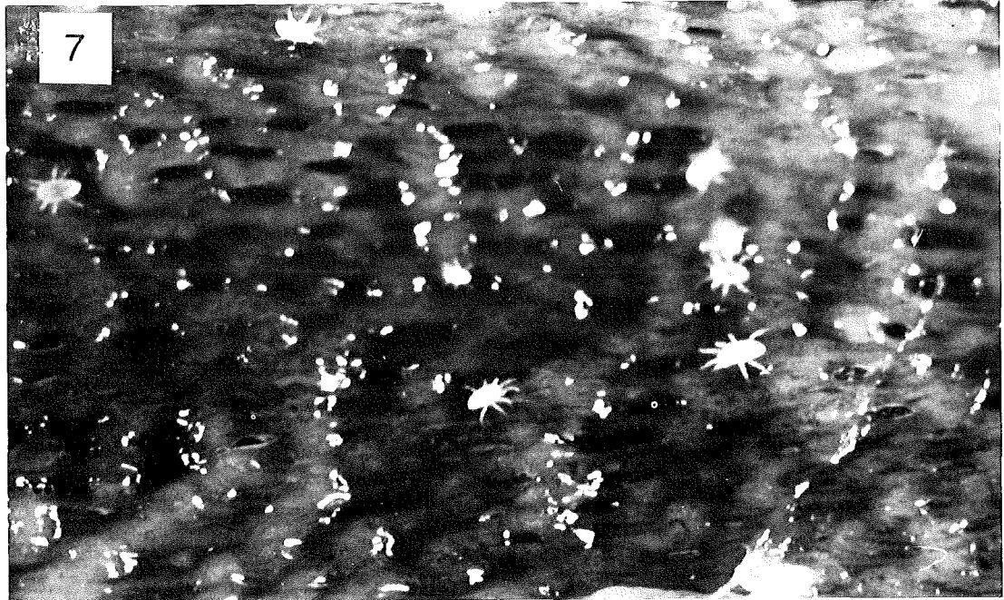
Fig. 7. Entonyssus squamatus sp.nov. Mites in the lung of the snake (main internal bronchus).

HOST AND LOCALITY —Holotype and 79 paratypes female, 6 paratypes male and 2 paratypes protonymph from the respiratory tract of a snake, Elaphe schrencki Stejneger, 1925, from Aldan-Plateau (East Siberia), USSR. Holotype in Institut royal des Sciences naturelles de Belgique, paratypes in the collections of the authors.