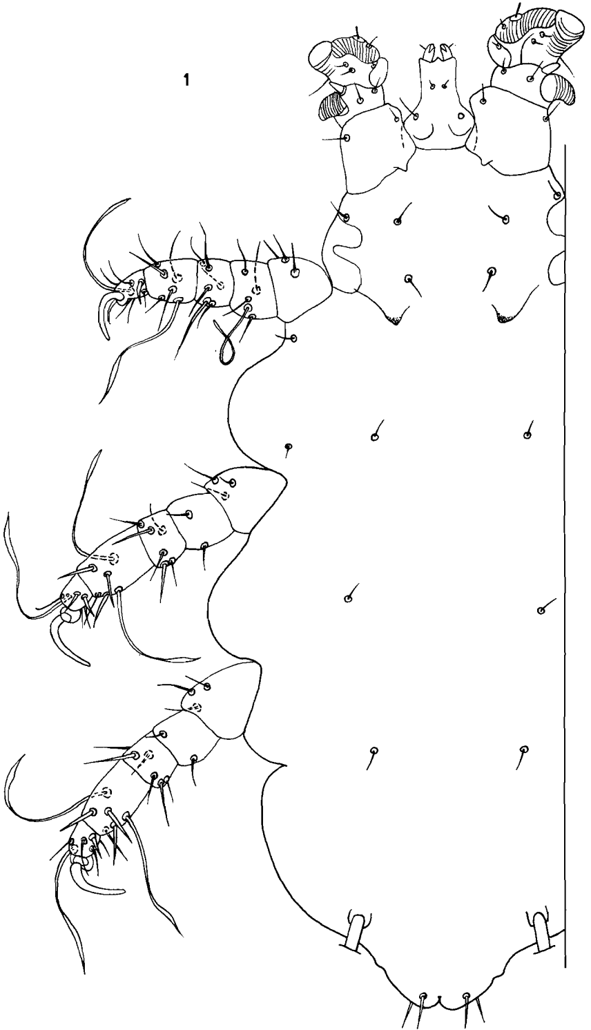
FIGURE 1. Amorphacarus soricis sp. n. Female ventrally.