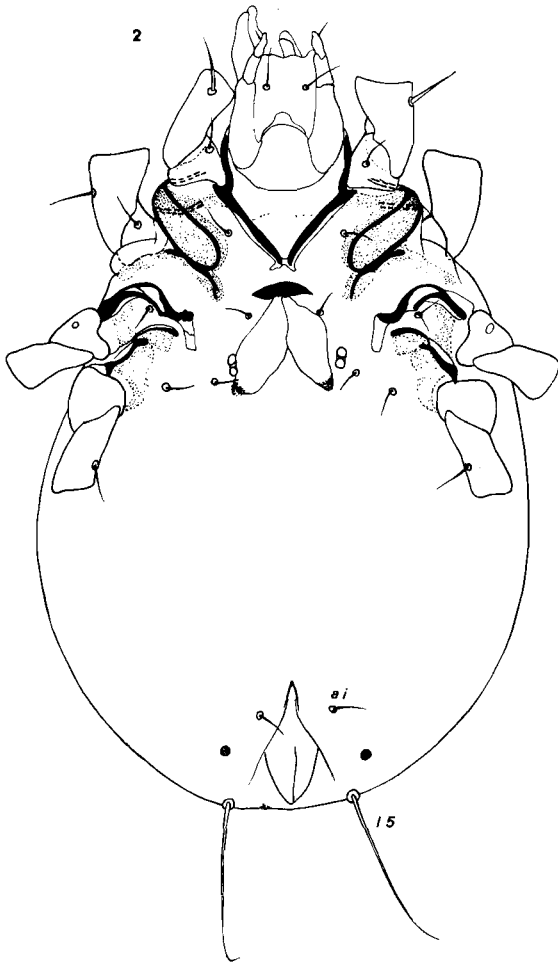
FIG. 2. — Algophagopsis pneumatica sp. n. Female in ventral view.