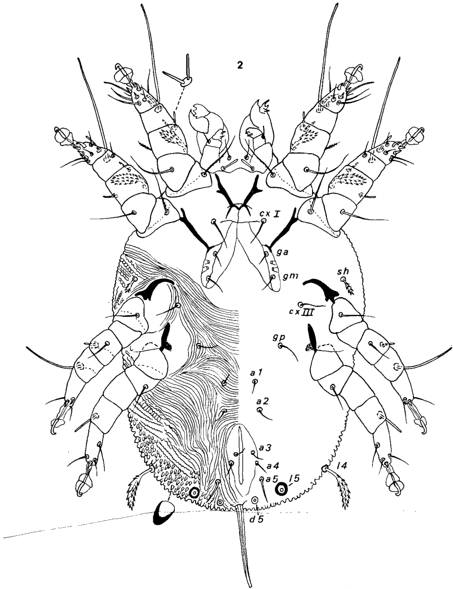
FIG. 2. — Nycteriglyphus surinamensis sp. n. : Female, ventrally.