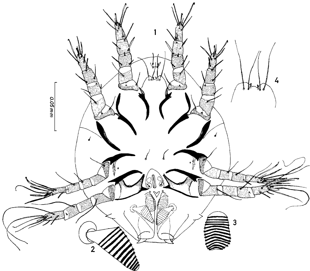
FIGS. 1-4. Orycteroxenus canadensis n. sp. Hypopus in ventral view (1); claspers (2, 3); palposoma (4). (N.B.: Scale is given only for Fig. 1).

This new species is distinguished from the four other species of the genus Orycteroxenus by the shape of the epimerae I, which are widely separate; the greater length of the hair of tibia IV; the very poor development of setae v i and the ventral situation of v e , the more internal situation of the solenidia alpha . It differs, in