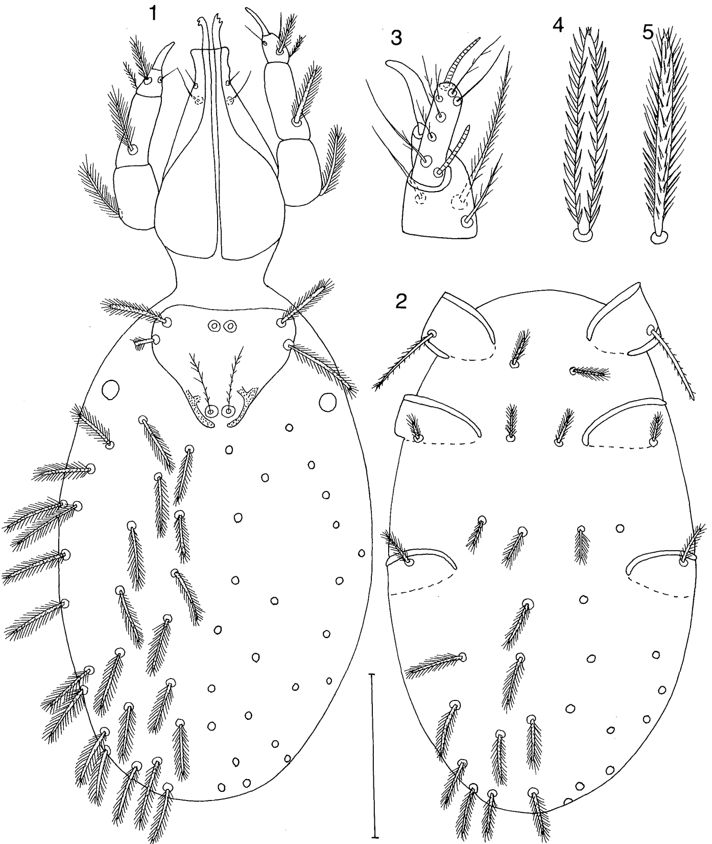
Figs. 1-5. Leptus rwandae n. sp. (Larva) - 1. dorsal view, 2. ventral view, 3. palptibia and palptarsus, 4. anterior surface of a dorsal seta of idiosoma, 5. posterior surface of same seta as in Fig. 4 (setae erected). Scale line 100 \mu m (Figs. 1-2).