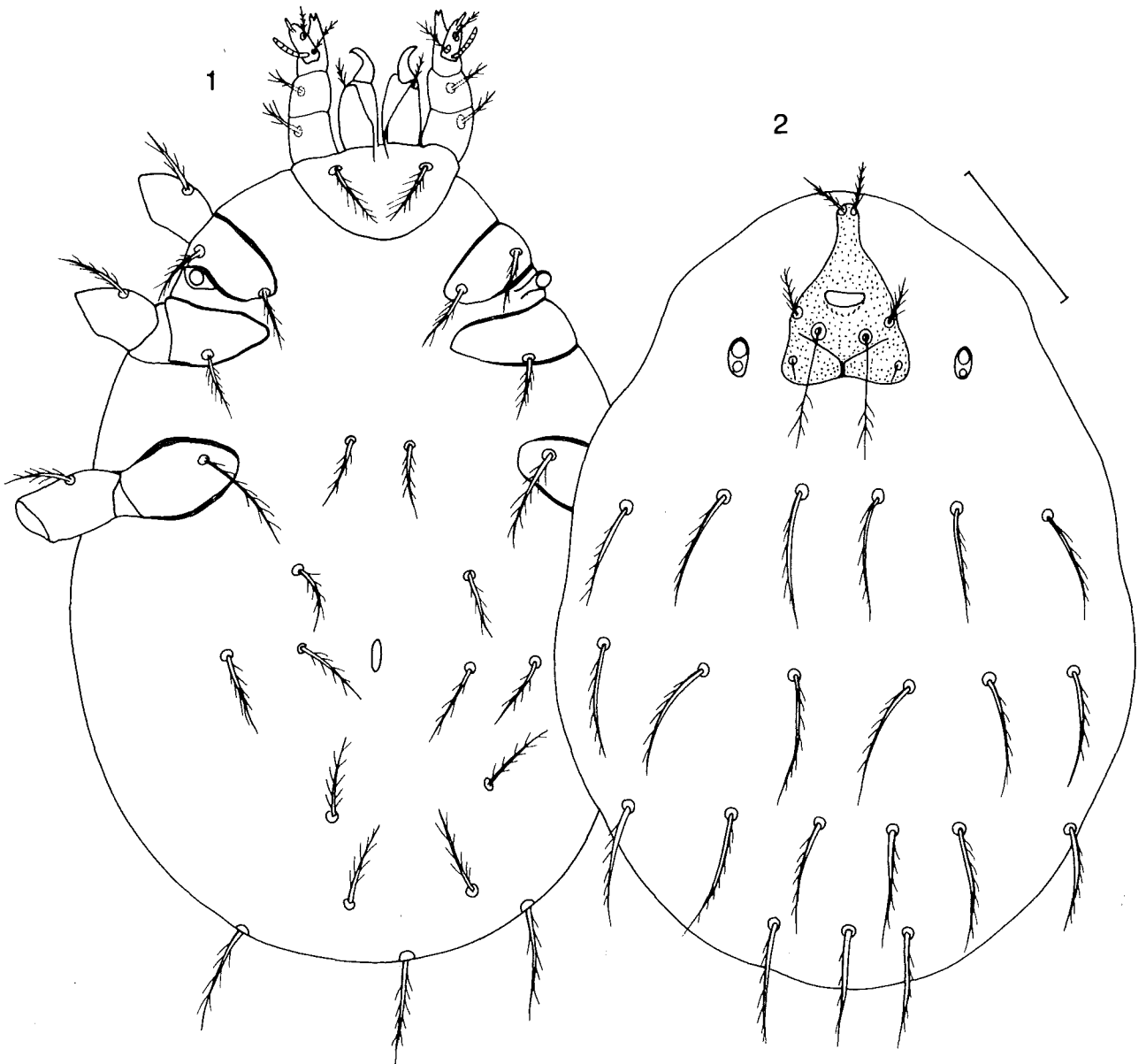
Figs 1-2. - Durenia papuana n.sp. Larva: ventral (1) and dorsal (2) view. Scale line 50 \mu m.