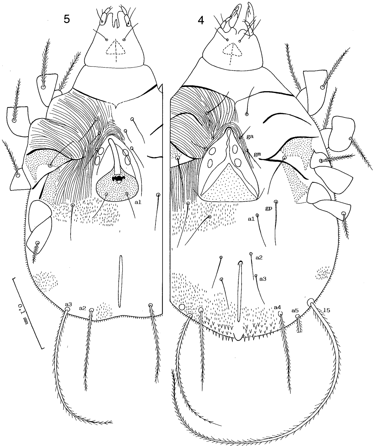
FIGS. 4-5 : Austroglycyphagus thailandicus sp. n., female (4) and male (5) in ventral view.