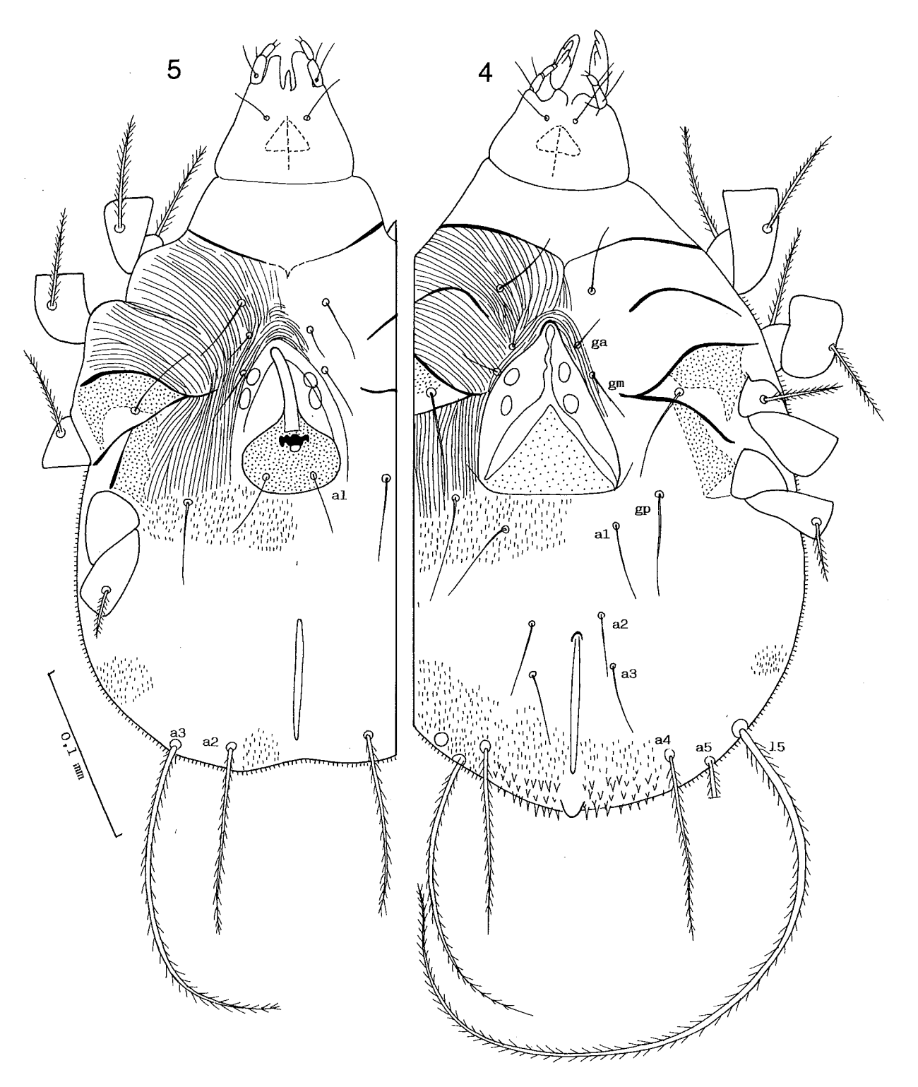
Figs. 4-5: Austroglycyphagus thailandicus sp. n., female (4) and male (5) in ventral view.