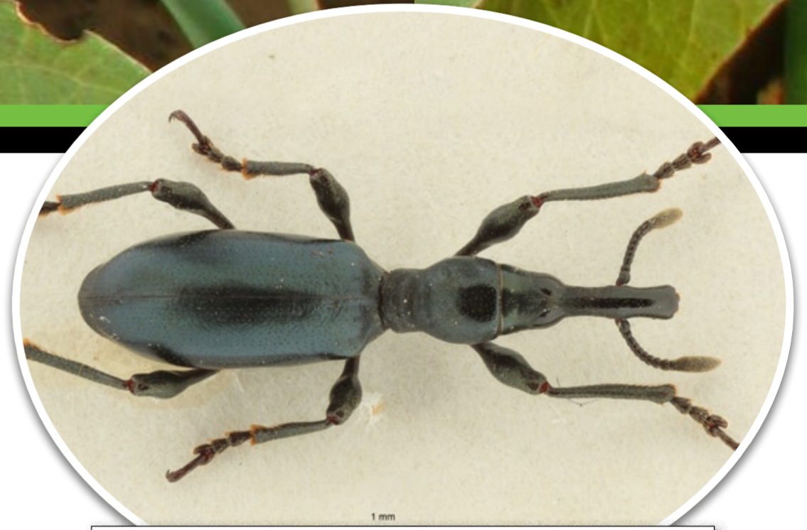
Cylas puncticollis – female