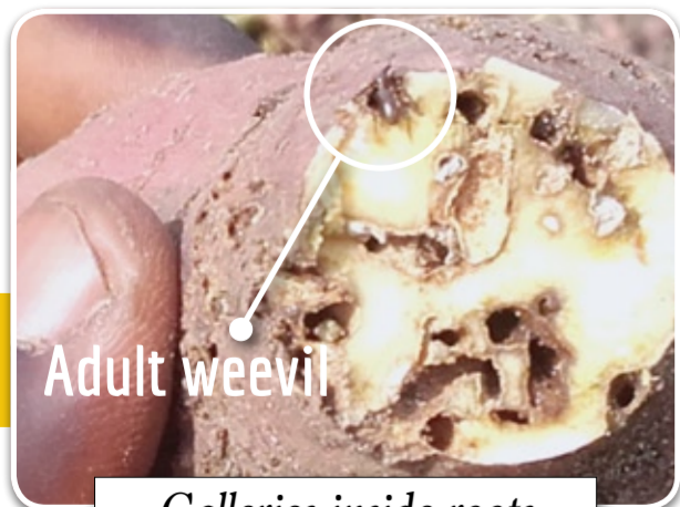
Galleries inside roots