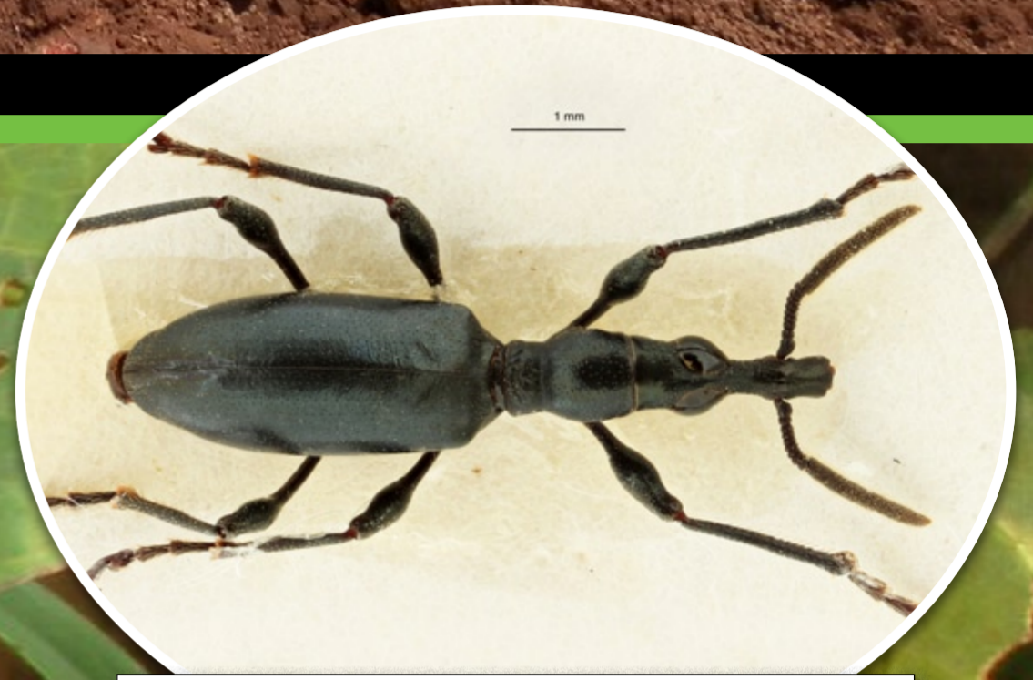
Cylas puncticollis – male