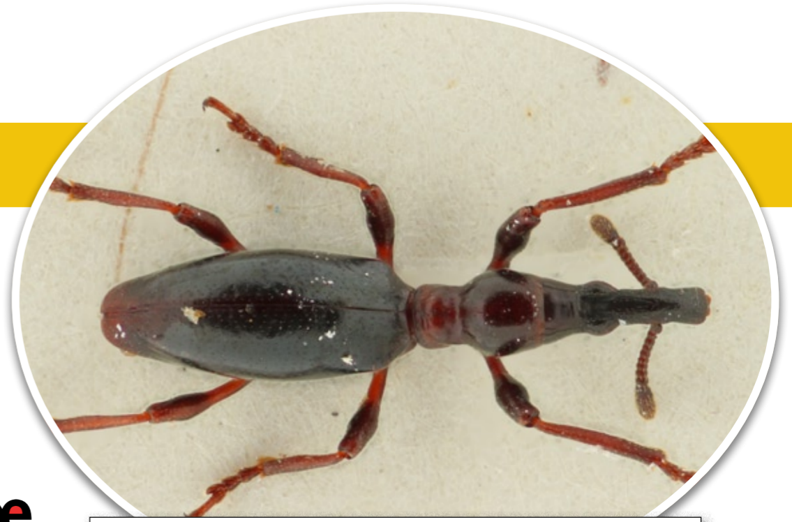
Cylas brunneus – female