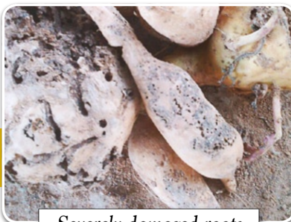
Severely damaged roots

For more information: Contact the CSIR-Crops Research Institute, MoFA's Plant Protection and Regulatory Services Directorate (PPRSD), and the University of Ghana.