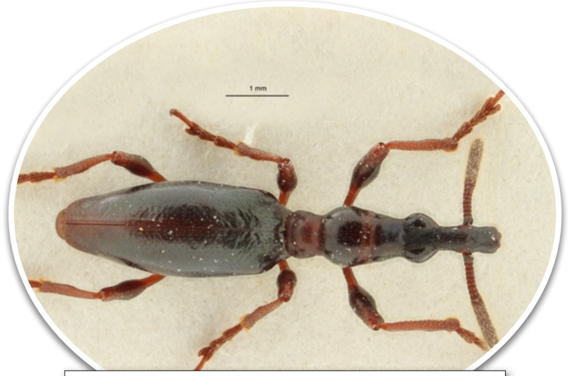
Cylas brunneus – male