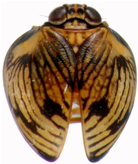
Hemisphaerius cattienensis sp. nov.