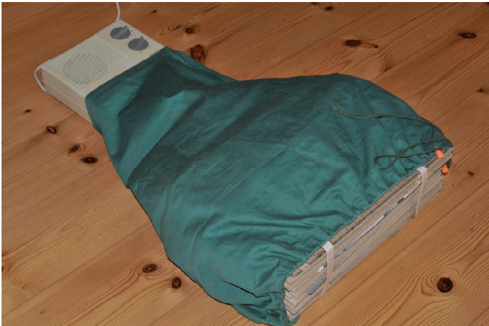
Fig. 4. Drying set with an electric heater and a funnel of fire resistant canvas.

Under humid conditions as in the tropics a drying set is recommended. Such a set is based upon air-drying forced by a fan heater or other heat sources. The warm air is conducted through the plant press, thereby drying the plant material. Botanists have competed with each other to invent (funny) drying constructions by using various heat sources like charcoal, light bulbs, kerosene or propane (which doesn't work in high altitudes due to the low oxygen content of the air!). However, exaggerated heating is to be avoided to preserve colours and to prevent browning of plant tissue (Camp, 1946; Allard, 1951).