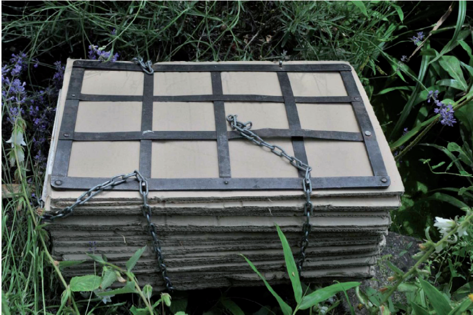
Fig. 3. Plant press, with specimens in newspaper sheets between corrugated cardboard.

Between the papers with the specimen, put blotting paper or corrugated cardboard. Place this stack between two light boards with holes for better drying and clamp it securely with two or three straps (Figs 2 & 3).