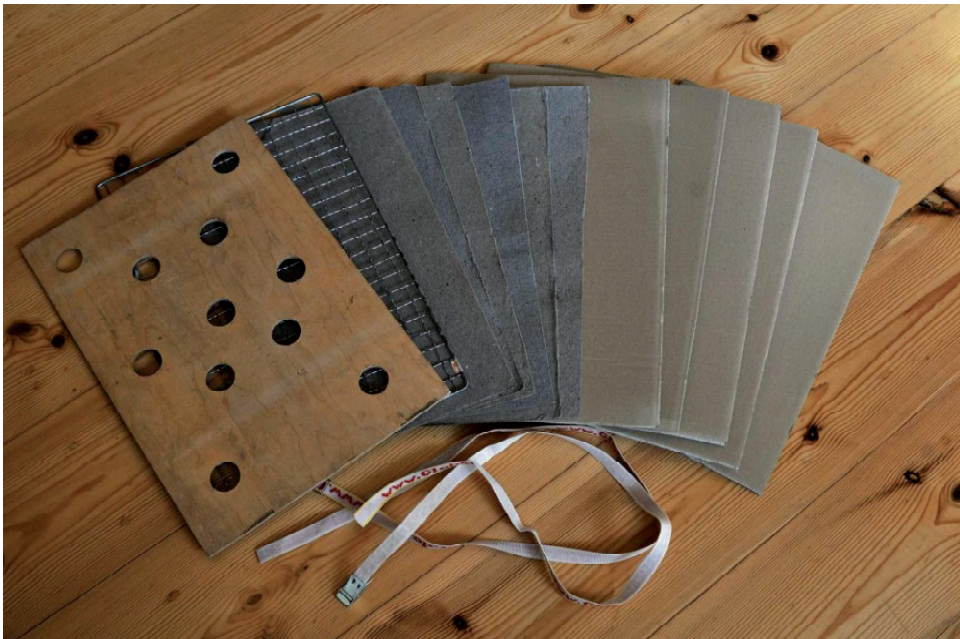
Fig. 2. Simple equipment for pressing plants: plywood pieces or metal frames for the outsides of the press, absorbent paper, corrugated cardboard, and lashing straps.

Aquatic plants need a special treatment, too (Taylor, 1977; Lot, 1986; Rayna-Roques, 1989). Arrange them on a paper floating in a tub filled with water, the paper being of the same size of the definite herbarium sheet. After the arrangement pour the water slowly and carefully out of the tub. The plant will remain attached to the paper sheet and is ready to undergo the regular drying procedure (see above).