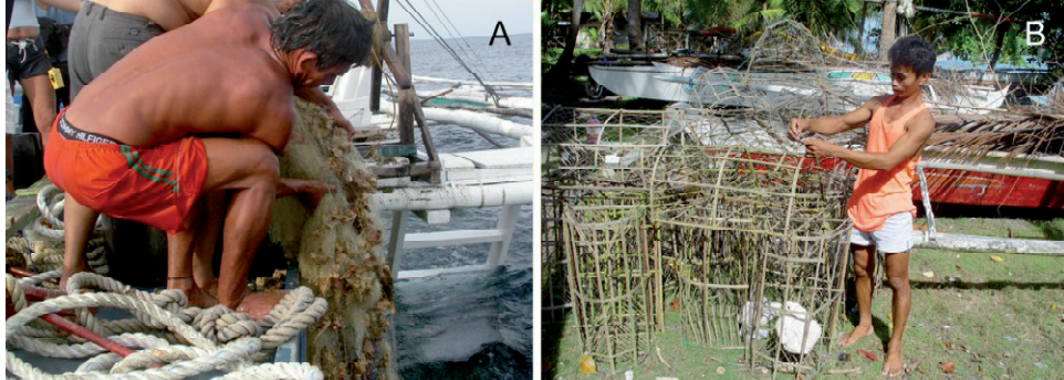
Fig. 4. Artisanal sampling. A. Deployment of locally made traps; B. Retrieval of lumun lumun off Balicasag Island.

tangle nets and lumun lumun (Fig. 4B) were adopted from traditional Filipino fishermen and used effectively in Panglao (Ng et al. , 2009) and subsequently adopted during the later Santo expedition. Fishermen also have a wealth of local knowledge about habitats, natural history, tides and currents that can greatly facilitate planning the site, station choice, and method selections.