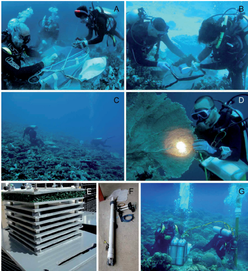
Fig. 3. Scuba based sampling. A. Underwater brushing for micromolluscs; B. Brushing rubble for cryptic species; C. Hand collecting among rubble and coral on forereef; D. Investigating gorgonians for associated mollusks; E. ARMS pre-deployment; F. Vacuum set-up; G. Vacuum suction in operation.

Scuba diving and/or snorkelling allow very selective sampling and choice of specific places and microhabitats. Underwater sampling is also very useful for observing species in their natural state and for obtaining more detailed information about the structure of benthic communities and other valuable ecologic data.