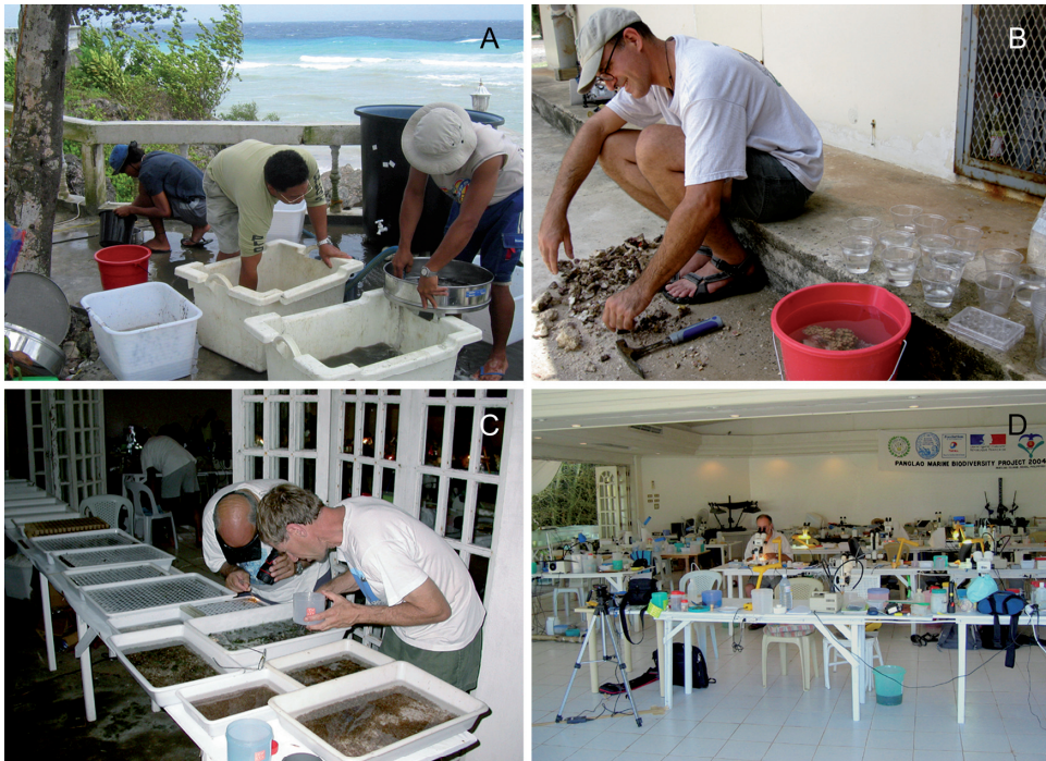
Fig. 5. Field lab sample sorting. A. Fine sieving of bottom samples, Panglao 2004; B. Breaking rubble, Moorea Biocode 2008; C. Specimen sorting, Panglao 2008; D. Field lab for Panglao Biodiversity Project 2004. (Photos A, C & D by Panglao Marine Biodiversity Project 2004; B by Chris Meyer).

At the field lab, bulk samples and residues can be sieved in fresh seawater, and fractionated through a set of sieves from 10 to 0.5 mm, so that the coarse and fine fractions are separated (Fig. 5A). Obvious, and especially fragile, macrobiota (nudibranchs, polyclad flatworms, etc.) should be separated prior to sieving to minimize damage. The coarse fractions are sorted by eye, while fractions below 3 mm are sorted with the aid of dissecting microscopes (Fig. 5C-D). Picking of smaller fractions can be very time consuming, and if field time is more limiting than post-field lab time, then they can be preserved unsorted for later picking and study. A washing/sieving area should be located close to the field lab and a source of seawater assured.