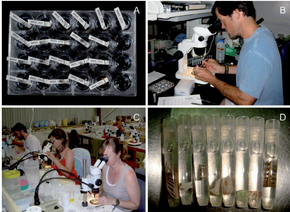
Fig. 7. Tissue subsampling for molecular work. A. Sorted micromollusks relaxing prior to tissue sampling; B. Tissue subsampling straight into digestion buffer for DNA extraction onsite, Morrea Biocode 2008; C. Barcoding Alley, tissue subsampling, Santo 2006; D. Echinoderm subsamples in 2D barcoded tubes. (Photo A by Chris Meyer; B by John Deck; C by Yuri Kantor and D by John Starmer).