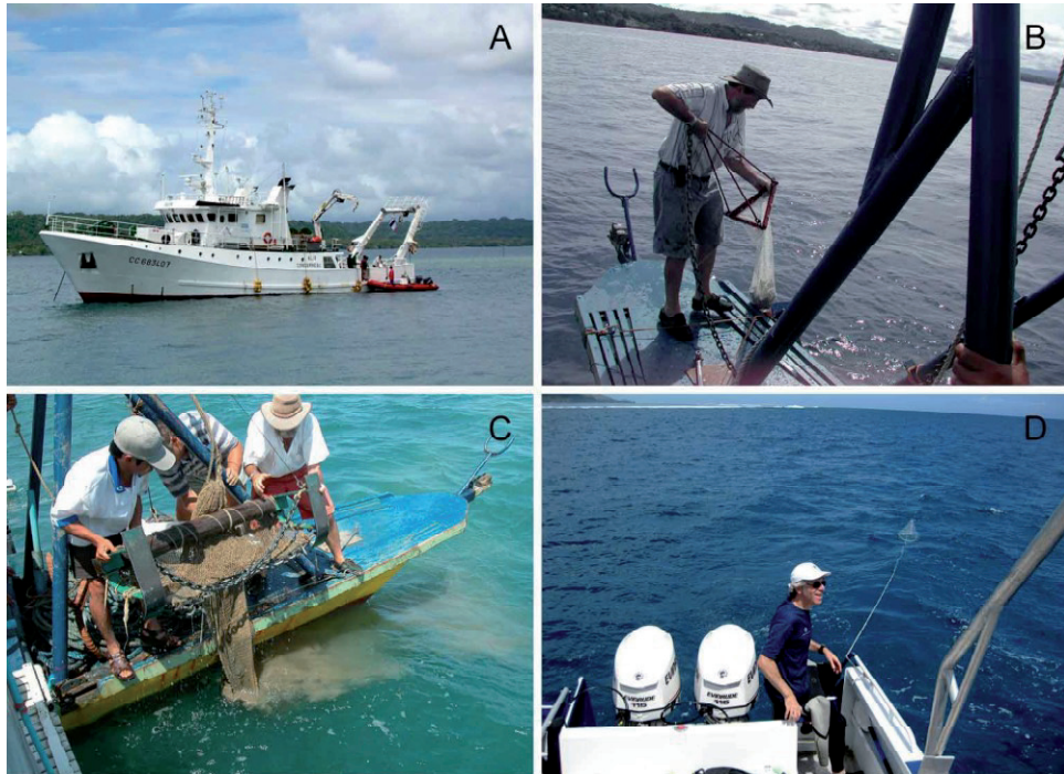
Fig. 1. Surface based sampling. A. French research vessel Alis of the IRD center; B. Dredge haul off the coast of Cortes; C. Trawl haul from the deep; D. Off shore plankton tow.

example, requires a very large winch with at least 11 km of cable in order to allow for the towing angle. It takes up to 24 hours to let out that much wire, obtain a sample, and retrieve it. Cost of shiptime can easily exceed 20,000 € per day.