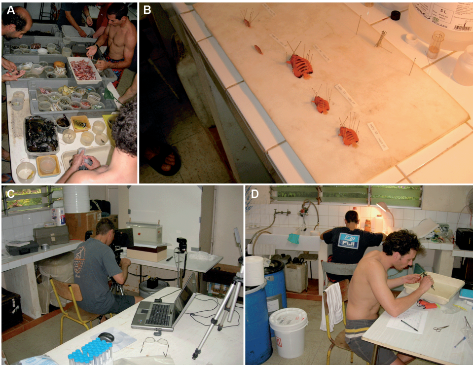
Fig. 6. Fish sorting and workflow. A. Morphosorting a fish station sample; B. Preparation for photography; C. Photography; D. Tagging vouchers. (Photos by Chris Meyer).

Whenever possible it is useful to sort samples to morphospecies, because color and other useful field characters which allow for rapid species level sorting can fade or be lost upon preservation, making field sorting much more efficient for many taxa. The general workflow for processing a single fish collecting station is shown in Figure 6. After morphosorting, representative samples from the species were tissue subsampled (not shown), prepped, photographed and then tagged with unique identifiers. Efficient collecting yields many more specimens than can be processed at this level of detail while in the field, and remaining material can be bulk fixed, tagged only with a station number, and sorted back in the home lab.