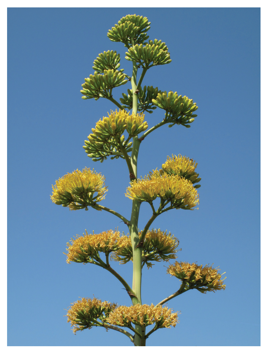
Fig. 58. Branched inflorescence of Agave wercklei F.A.C.Weber ex Wercklé.

It is unknown when and where the species was introduced into South Africa. It was more than likely brought in for its value as a horticultural plant, given that it will not sucker in a pot or the open ground, making it more manageable than species such as Agave americana and A. sisalana . The species was originally recorded from a single locality near the Baakens River Valley in Port Elizabeth in the Eastern Cape Province, but has more recently also been observed near Pietermaritzburg in KwaZulu-Natal.