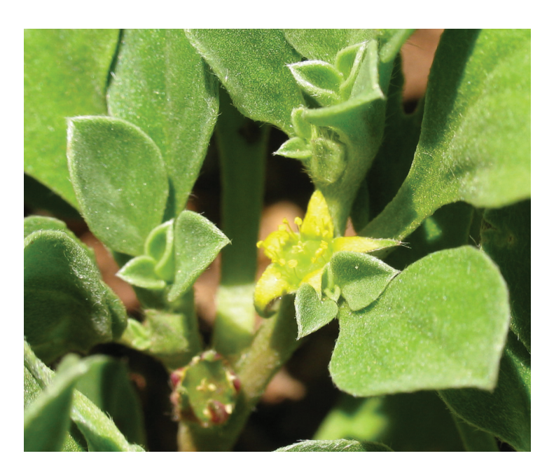
Fig. 71. Flowers and crystalline leaf surface of Tetragonia tetragonioides (Pall.) Kuntze.