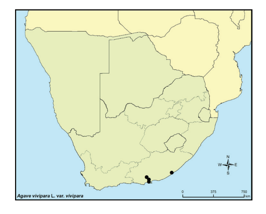
Fig. 52. Distribution map of Agave vivipara L.