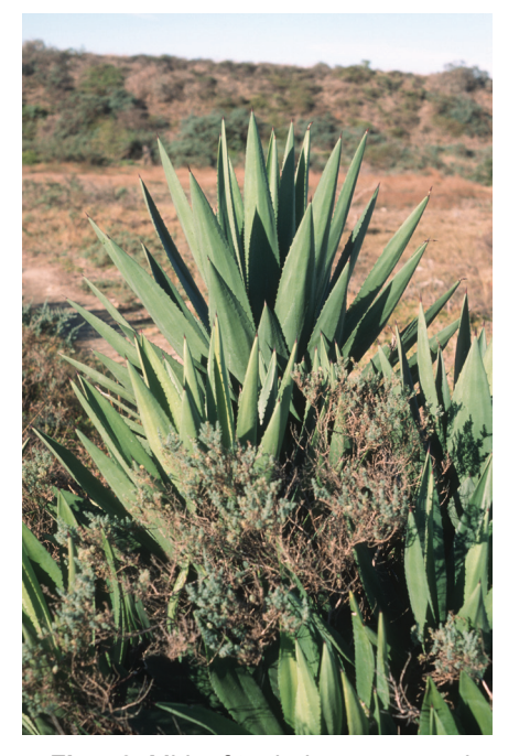
Fig. 53. Mid- of to dark green swordshaped leaves Agave vivipara L. carry marginal spines, unlike those of A. sisalana Perrine.