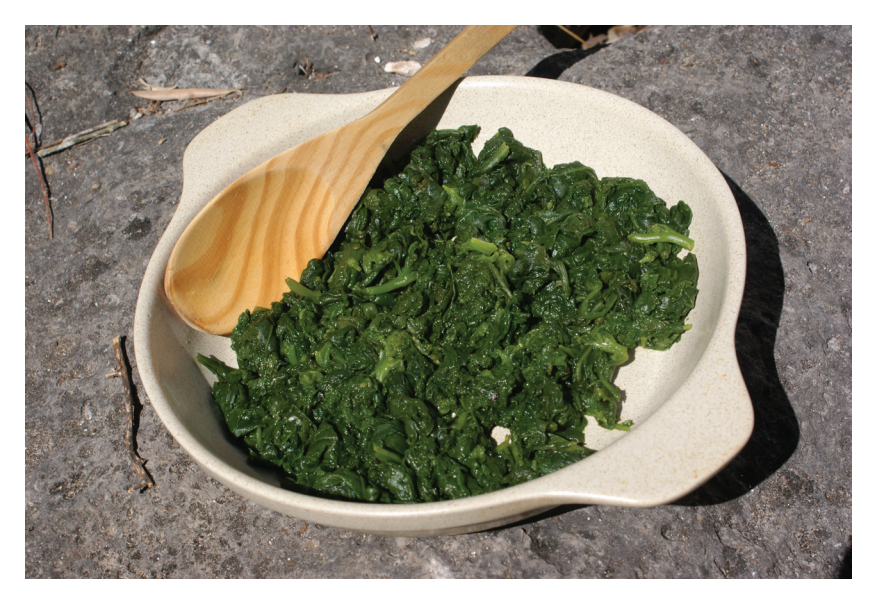
Fig. 68. A dish prepared from Tetragonia tetragonioides (Pall.) Kuntze leaves.