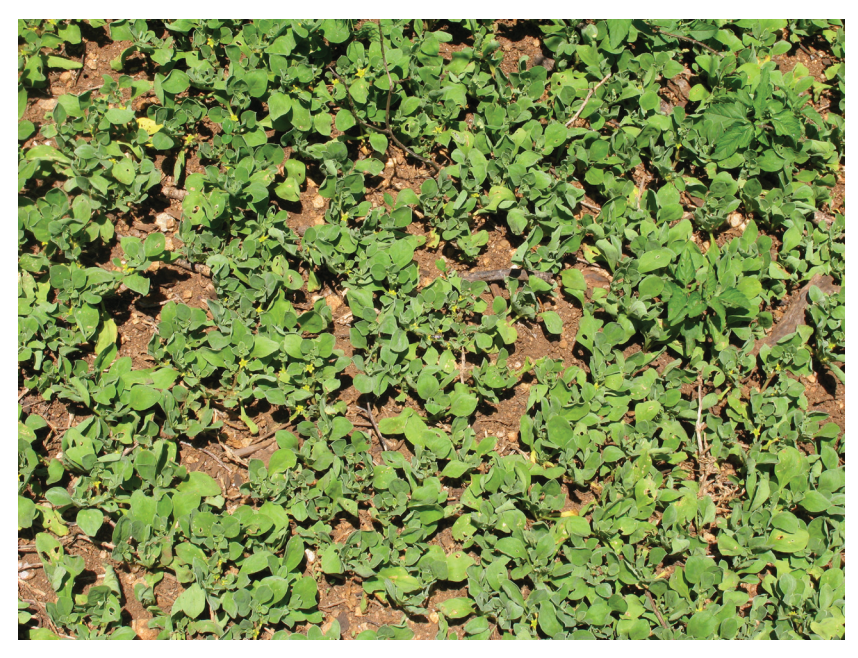
Fig. 69. Colony of Tetragonia tetragonioides (Pall.) Kuntze.