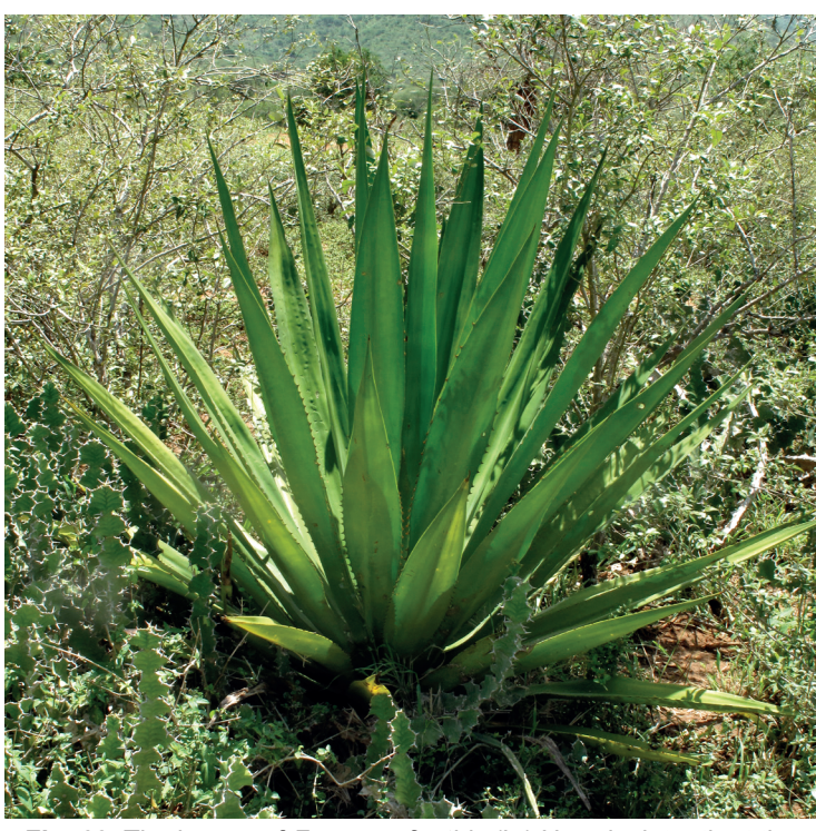
Fig. 63. The leaves of Furcraea foetida (L.) Haw. lack teeth at the distal end.