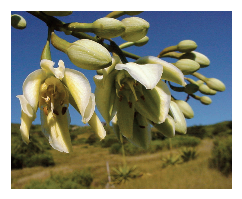
Fig. 64. The flowers of Furcraea foetida (L.) Haw. are bell-shaped and drooping.