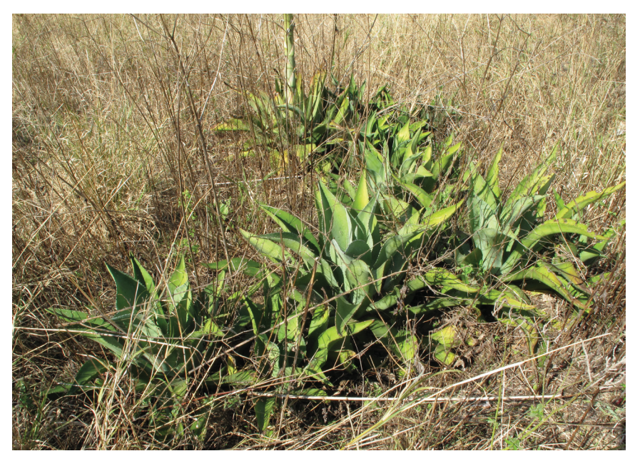
Fig. 59. Bulbils of Agave wercklei F.A.C.Weber ex Wercklé rooting and forming a colony.