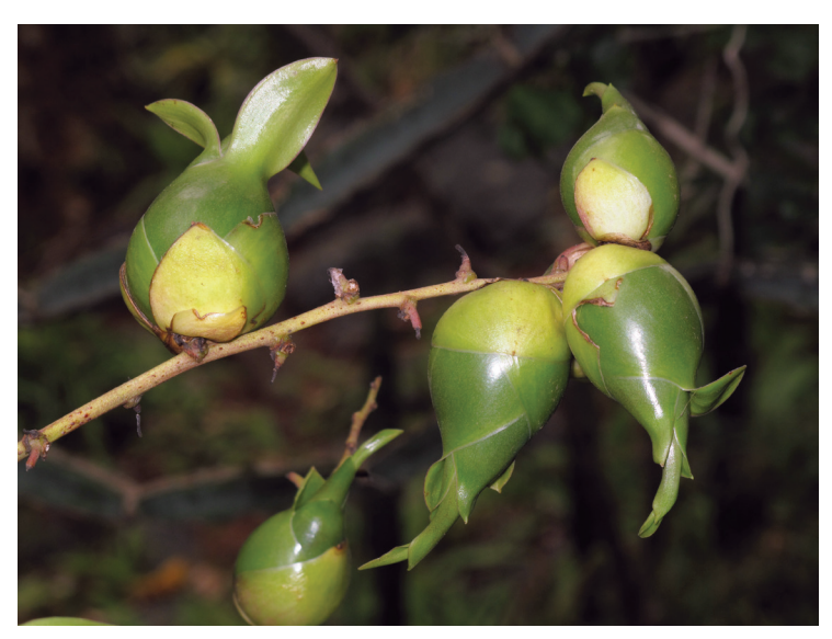
Fig. 65. Bulbils of Furcraea foetida (L.) Haw.