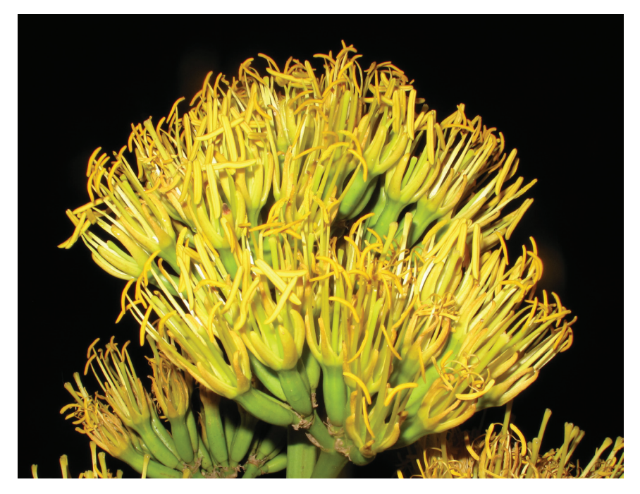
Fig. 60. Bright yellow flowers of Agave wercklei F.A.C.Weber ex Wercklé.