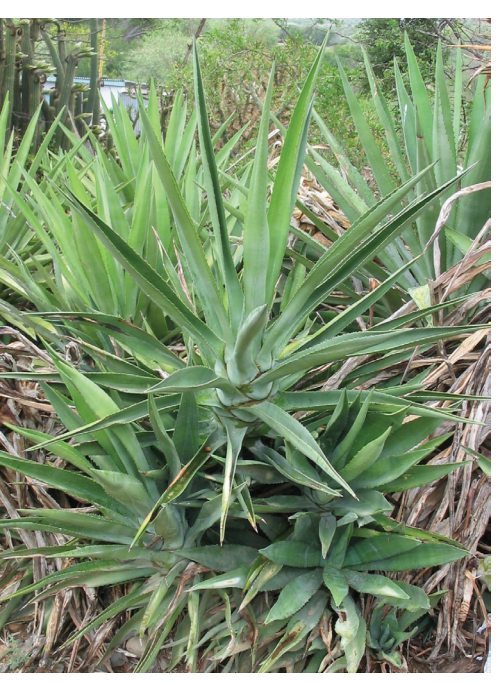
Fig. 54. Leaf bases are visible in Agave vivipara L. while in A. angustifolia Haw. they are obscure.