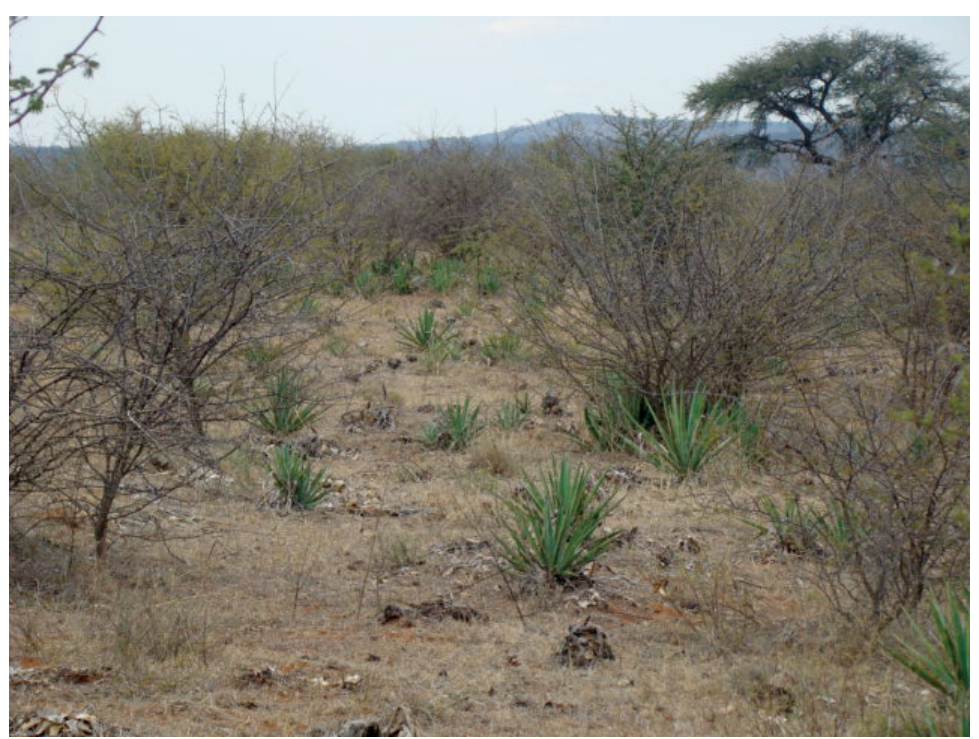
Fig. 51. Agave sisalana Perrine spreading into natural vegetation.