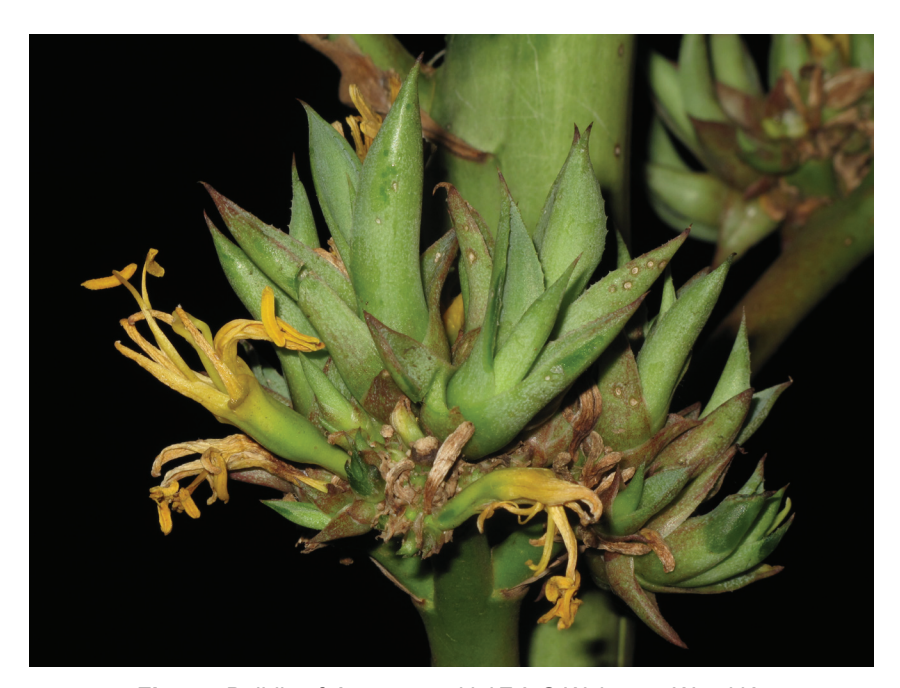
Fig. 57. Bulbils of Agave wercklei F.A.C.Weber ex Wercklé.