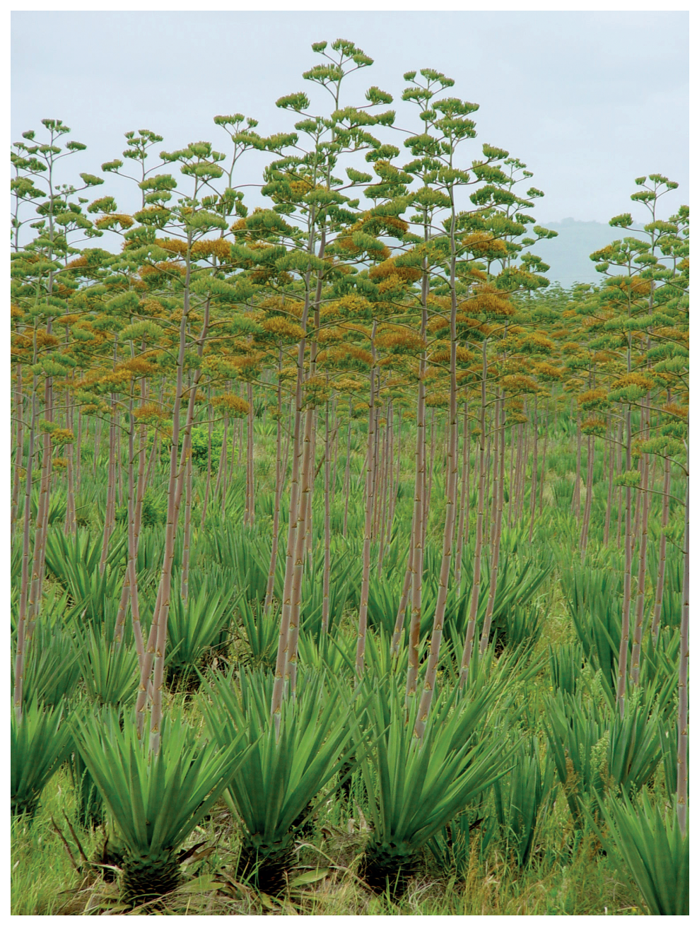
Fig. 49. Plantation of Agave sisalana Perrine.