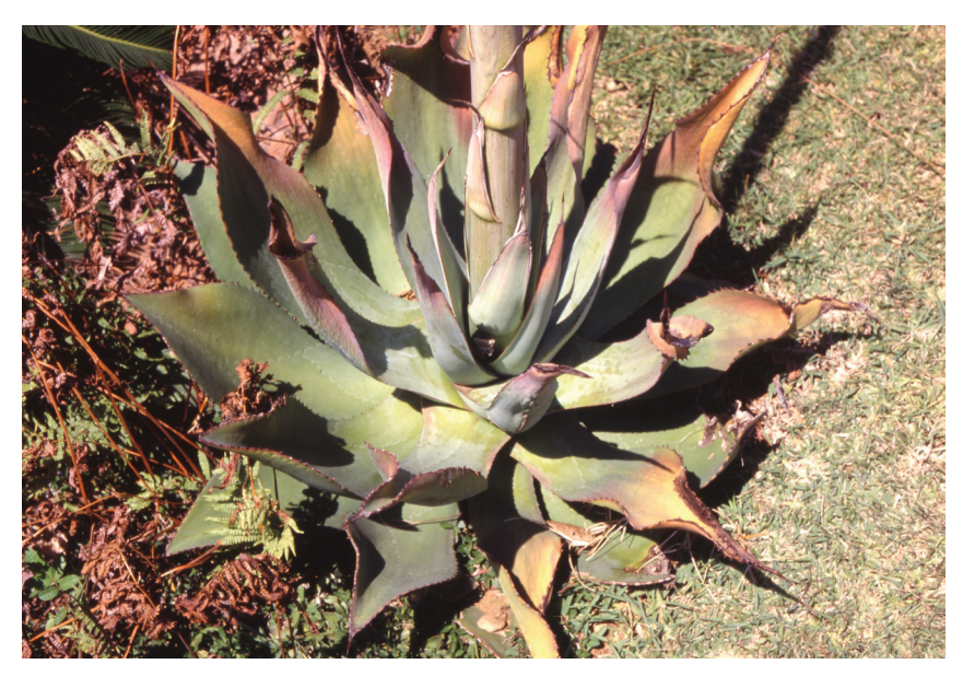
Fig. 56. Rosettes of Agave wercklei F.A.C.Weber ex Wercklé are non-suckering.