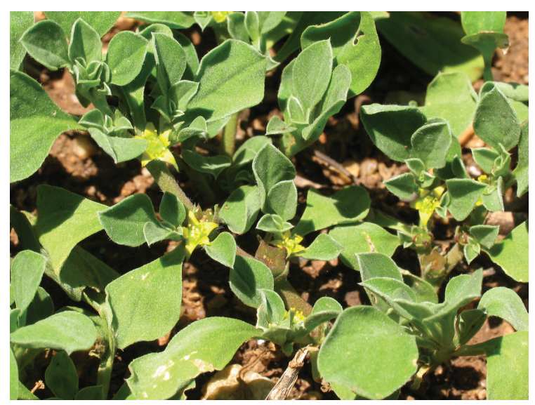
Fig. 70. Plant of Tetragonia tetragonioides (Pall.) Kuntze.