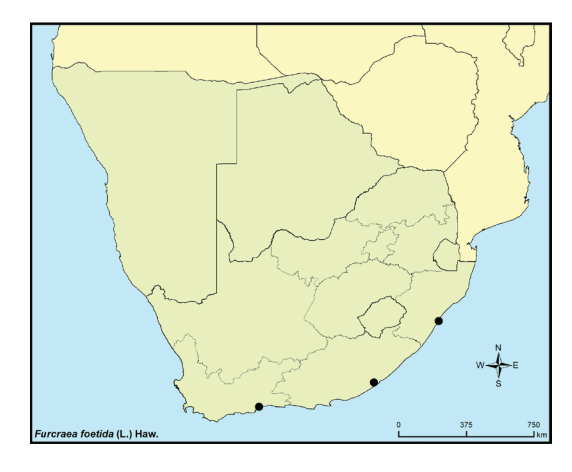
Fig. 61. Distribution map of Furcraea foetida (L.) Haw.

The arrival of Furcraea foetida in South Africa may be traced to its importation by the Natal Botanical Gardens (now the Durban Botanic Gardens) sometime before the early 1880's, c. 130 years ago (Crouch & Smith, 2011). Plants were previously established in plantations from where they have started escaping. Initial eradication efforts may have to be focused on the physical removal of plants. However, this labour intensive process may prove to be feasible in the case of isolated populations only.