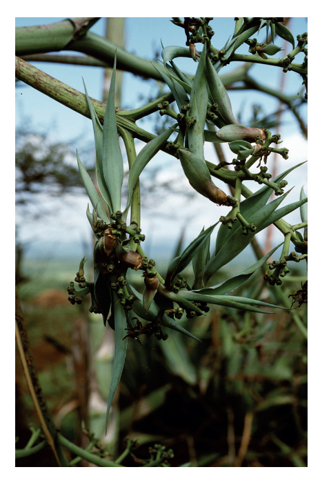
Fig. 50. Bulbils of Agave sisalana Perrine