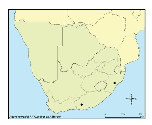
Fig. 55. Distribution map of Agave wercklei F.A.C.Weber ex Wercklé.

This is the only species of Agave naturalised in southern Africa that does not proliferate through basal or stem suckers before, or after, flowering (Fig. 56). To compensate for the lack of basal sprouts it produces thousands of bulbils (Fig. 57) on the tall branched inflorescence after flowering (Fig. 58). These drop to the ground and easily strike root where they fall (Fig. 59). The flowers are a pleasant bright yellow colour (Fig. 60).