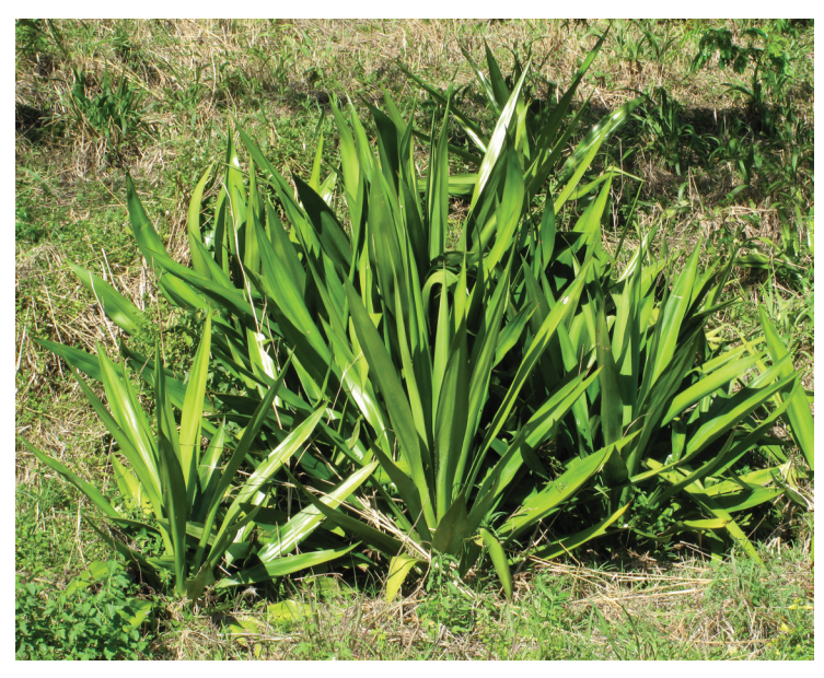
Fig. 62. Leaves of Furcraea foetida (L.) Haw. are verdant green.