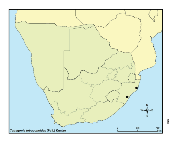
Fig. 67. Distribution map of Tetragonia tetragonioides (Pall.) Kuntze.

It is naturalised in the coastal region of KwaZulu-Natal in South Africa. It is possible that the introduction of this species is due to plants being washed ashore from passing ships (Fox & Norwood Young, 1982). A place near Richards Bay is known as Spinach Point due to the fact that local Zulus would load their canoes with plant material from that area (Fox & Norwood Young, 1982). Plants are frost-sensitive (Plants for a Future, 2008) and unlikely to survive the cold winters of the South African interior above the Great Escarpment without protection under glass or in plastic tunnels. Thus far the species does not appear to be problematic and no eradication measures are necessary. However, where possible, known populations should be monitored for future expansion. Vegetatively plants (Fig. 69, 70) look similar to some representatives of what Smith et al. (1998) termed the 'weedy mesembs', but the flowers of T. tetragonioides are insignificant (Fig. 71), unlike the strawberry-red ones of the similar-looking Aptenia cordifolia (L.F.) Schwantes, for example.